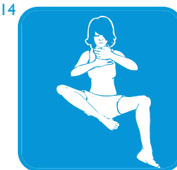
High Heart to Throat