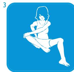
Knee to Hip