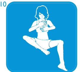
Heart to High Heart