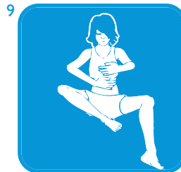
Solar Plexus to Heart