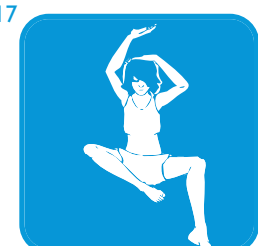
Crown to Transpersonal Pt.