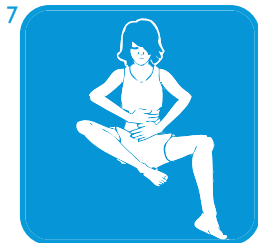
Sacral to Solar Plexus