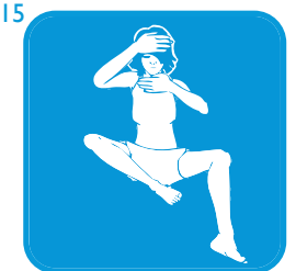
Throat to Brow