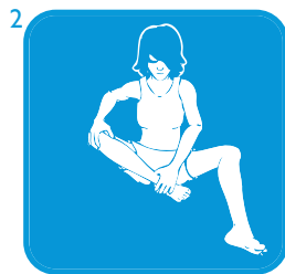
Ankle to Knee