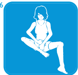
Root to Sacral