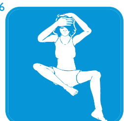
Brow to Crown