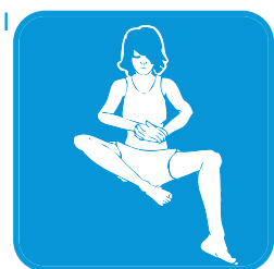
Wrist to Wrist