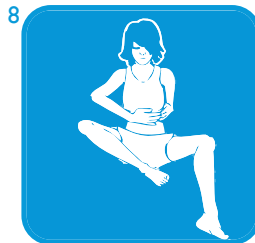
Solar Plexus to Spleen